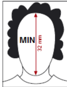
Minimum allowable size