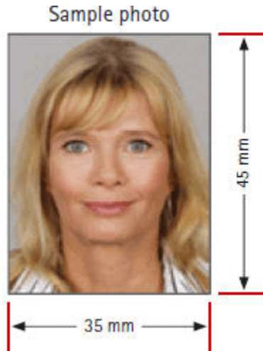
Photo Size Specifications

When you apply for a visa to Europe, the photos are among the vital requirements for the completion of your application. No matter what visa type you apply for, you will always be required to submit two photos, alongside with the other documents.